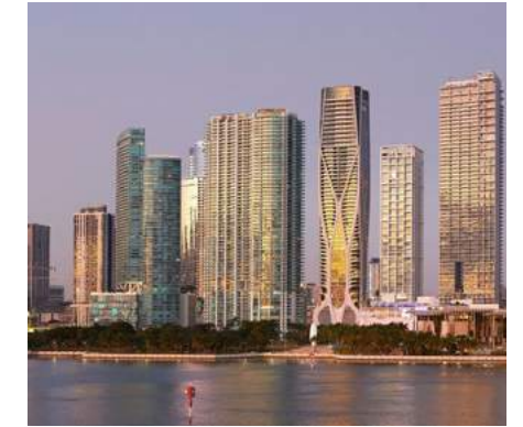
One Thousand Museum | Miami