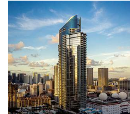
Paramount | Miami