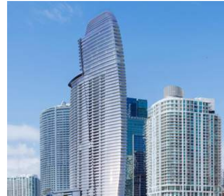
Aston Martin Residences | Miami