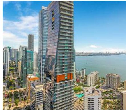
Echo Brickell | Miami

Sales trend by building - Downtown & Brickell